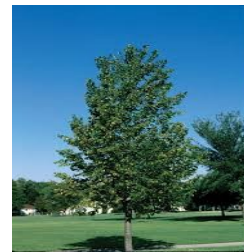
Corinthian Little Leaf Linden 1.5" 30' to 50' Mature Height Tree Habit: Shade, Yellow Fall Color, Fragrant Flower Quantity Purchased _____