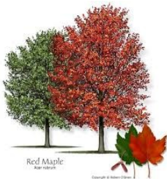
Burgandy Belle Red Maple 2" 35' to 50' Mature Height Tree Habit: Dark Green/Fall Color Quantity Purchased _____