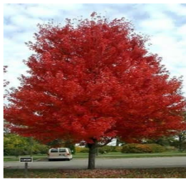
Autumn Blaze Maple 2" 45' to 50' Mature Height Tree Habit: Spreading Oval, Fall Color Quantity Purchased _____