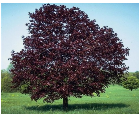
Royal Red Maple 2" 30' to 40' Mature Height Tree Habit: Shade, Reddish Bronze Quantity Purchased _____