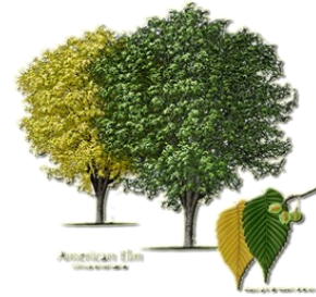
Accolade Elm 2" 40'to 50' Mature Height Tree Habit: Fast Growing, Spring Flowers Quantity Purchased _____